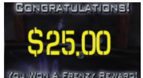
"Community" Winner (one per EGM on the link)