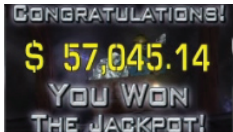
"Big" Progressive Winner (one per level)