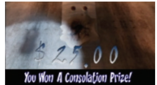
"Community" Winner (one per EGM on the link)